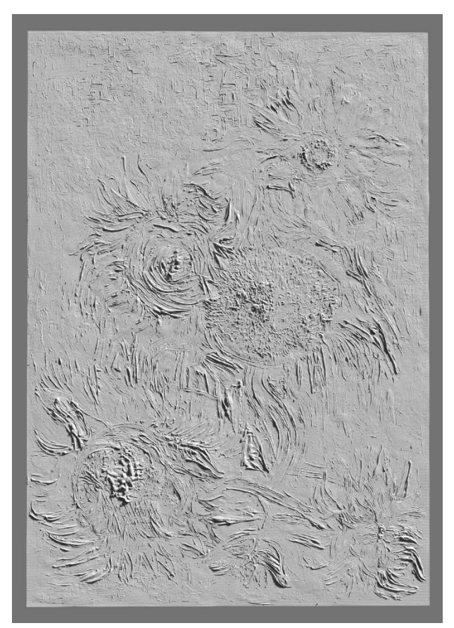
Render of the surface of the re-creation of Vincent Van Gogh's Sunflowers, 1888. The original was destroyed during World War II

Each of the six rooms will allow the visitor to engage with works of art in new ways, showcasing projects carried out by Factum Foundation. The first room will focus on the surface of paintings and on remaking paintings that have been destroyed by fire and war. The surface of each of the Polittico Griffoni panels will be shown with extreme raking light together with collaborations with The National Gallery, London, and MOMA, New York that have brought back to life paintings such as Vincent Van Gogh's Sunflowers, 1888, which was destroyed in Japan during the bombing of Osaka in World War II, and Claude Monet's Water Lilies, 1916, burnt in a fire at MoMA in 1958.