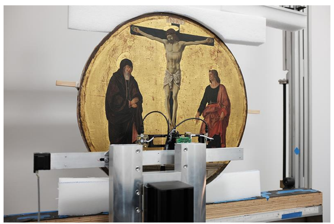
Lucida 3D scanner recording the Crucifixion by Francesco del Cossa in the National Gallery of Art, Washington

This unprecedented homecoming and celebration of technology were commissioned by Genus Bononiae. Musei nella città and supported by Fondazione Cassa di Risparmio in Bologna.