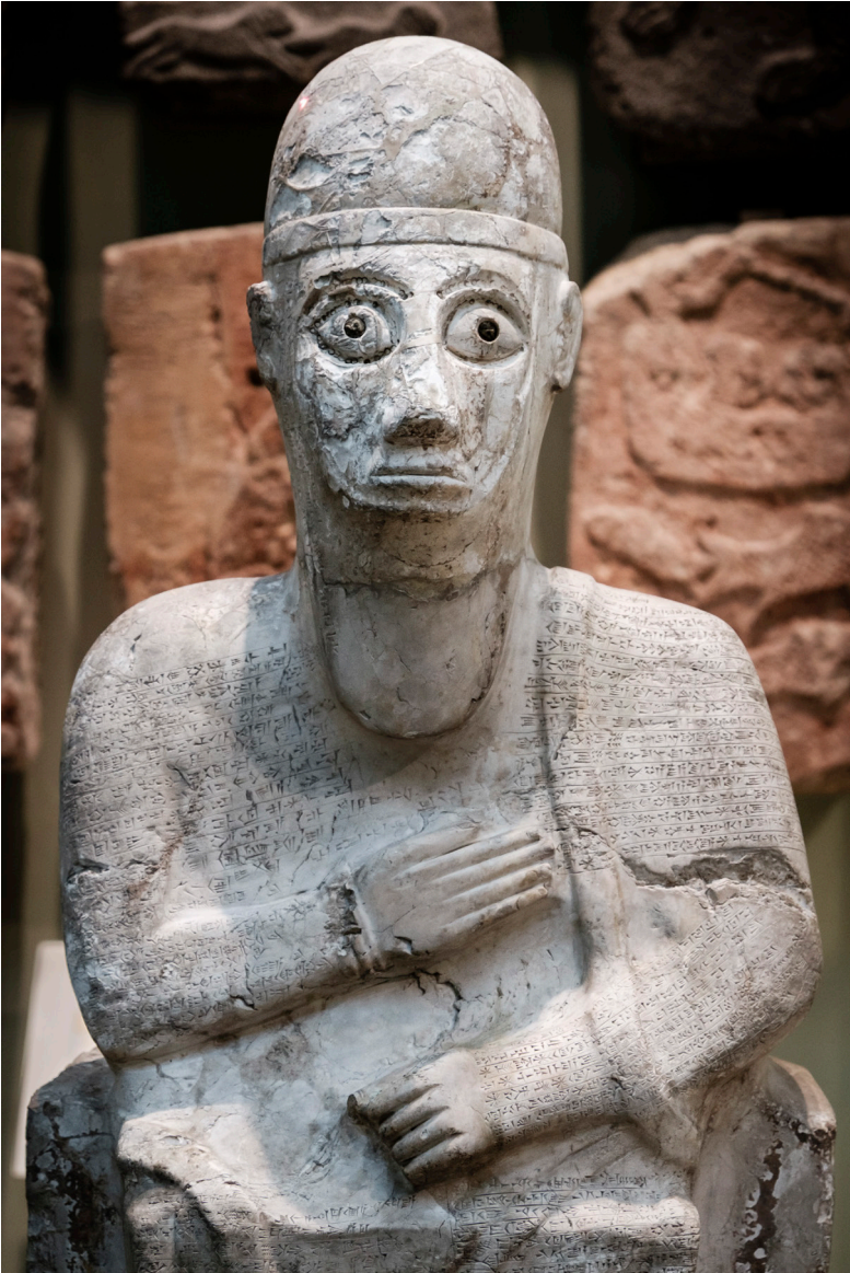
The Statue of Idrimi photographed during the recording session at the British Museum in February 2017