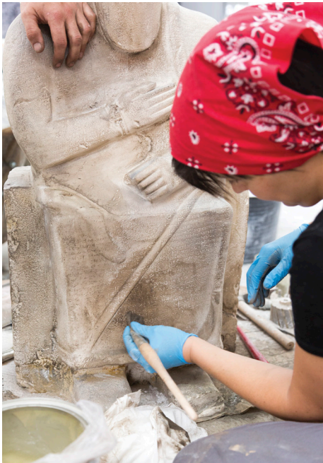
Applying the pigment onto the skirt of the plaster cast of Idrimi