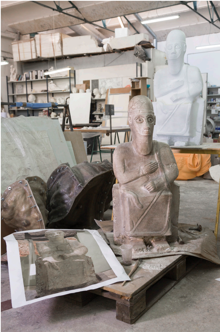
The facsimile of the statue of Idrimi at Factum Arte's Madrid workshops standing amongst printing and casting tests