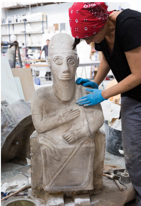
Rubbing the pigment into the plaster to mimic the soft weathered magnesite