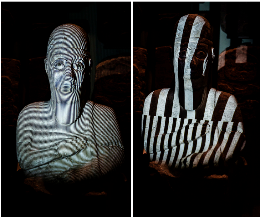
The Statue of Idrimi with projected patterns of white light on its surface during the recording with the Breuckmann

The Breuckmann is a structured or white-light scanner that works by projecting patterns of white light onto the surface of an object. Two cameras record the patterns and triangulate the position of points on the surface of an object, converting them to points in 3D space. The surface of the statue was recorded in sections, which were checked on-site by merging with OPTOCAD software to obtain a low-resolution model. The system produces accurately scaled 3D