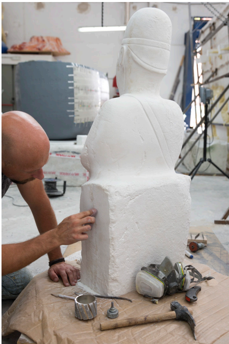
Finishing touches to the plaster cast before applying the pigment