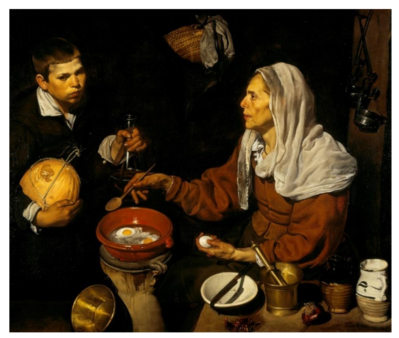
Diego Velázquez, Old Woman Cooking Eggs , National Galleries of Scotland. Purchased with the aid of the Art Fund and a Treasury Grant 1955